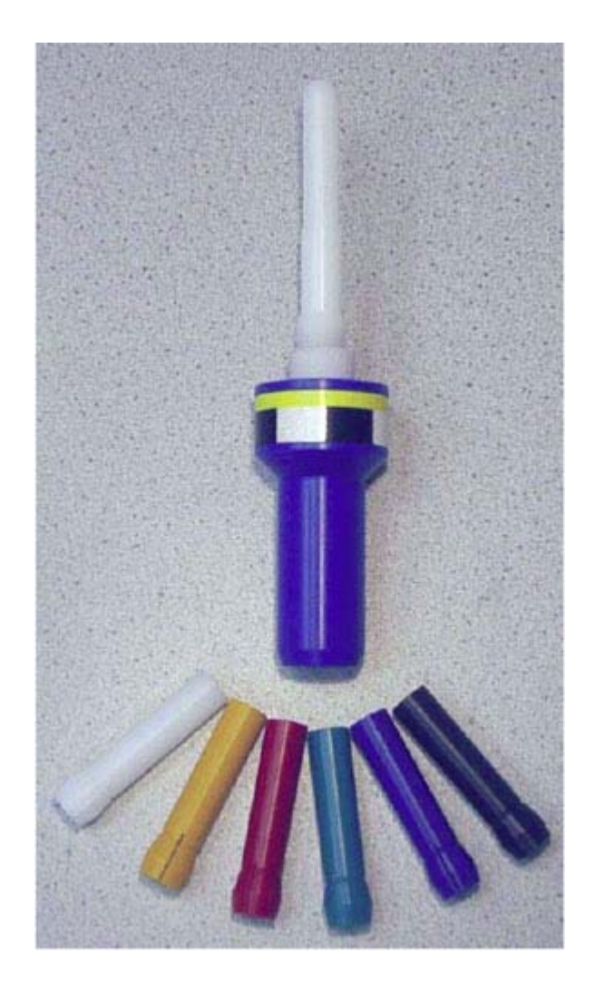
Figure 2.1. The MATCH System