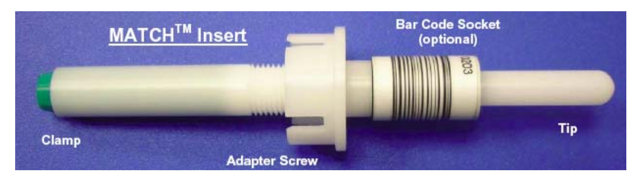
Figure 3.1. The MATCH Insert Assembly