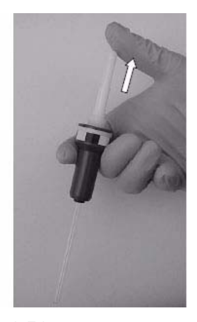
Figure 3.2. Inserting the Sample Tube